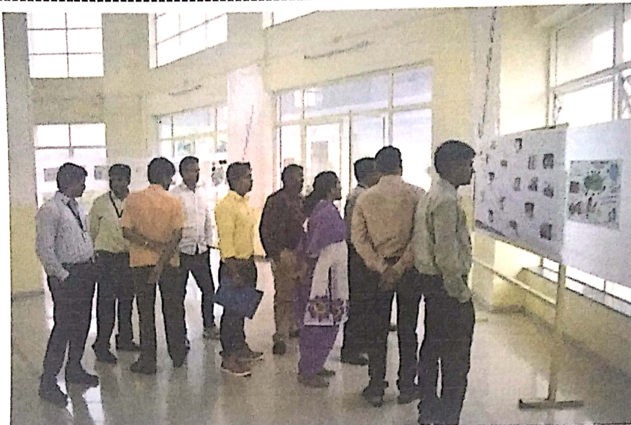
Poster Exhibition showing importance of traffic rules