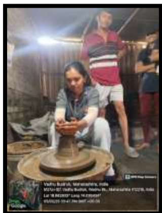
Pot Making by NSS Students