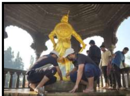
Swachhta at Dharmveer Chatrapati Sambhaji Maharaj Memorial