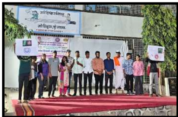
Cyber Fraud Drama by NSS Students