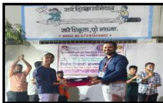
Prize Distribution at Mini Cultural Programme