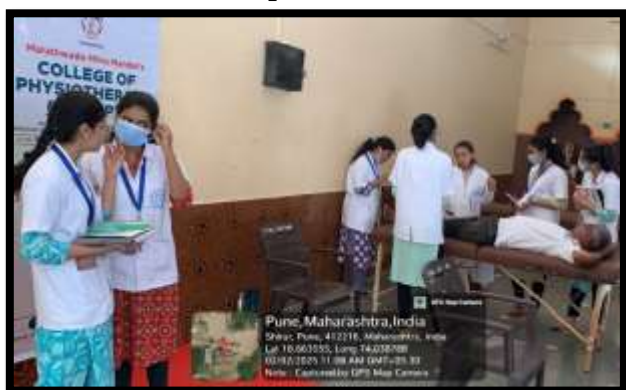
Physiotherapy Camp at Vadhu Budruk