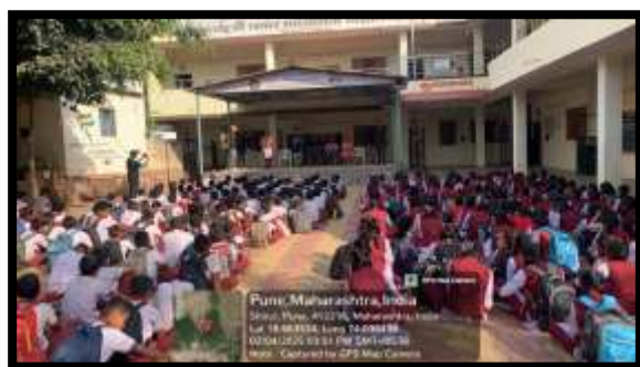
NSS students guidance session at SSM High School, Vadhu Budruk