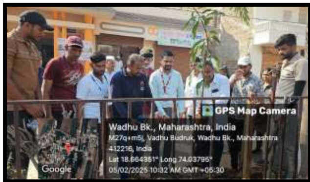
Tree Plantation with the hands of Sarpanch