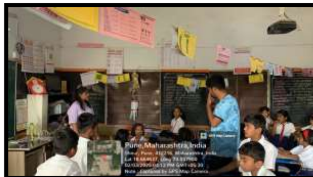
Session at Z. P. Primary School Vadhu Budruk