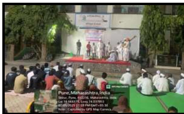
Kirtan programme for Vadhu Budruk