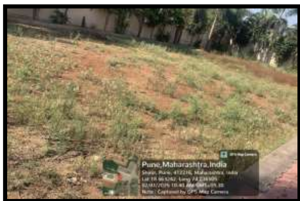
Bhairav Temple before Swachhata

The third day of the NSS camp began at 5:30 am with a wake-up call. At 5:45 am, warm-up exercises and stretching were followed by the National Integration Pledge, NSS Anthem, SPPU Anthem, and the National Anthem. The session ended at 8:00 am, and breakfast was served at 8:30 am. From 9:00 am to 10:30 am, the students cleaned the Bhairav Temple and Shiv Temple and spread awareness about the importance of Swachh Bharat Abhiyan among the residents. From 10:00 am to 5:00 pm, a Physiotherapy camp was conducted, receiving a response of over 100 locals. In the evening, women's games were organized by NSS students, with an overwhelming response.