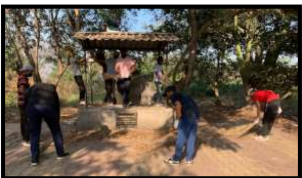
Swachhata at Dashkriya Ghat