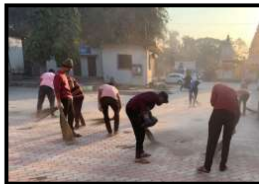
Swachhata at Z. P. School Area