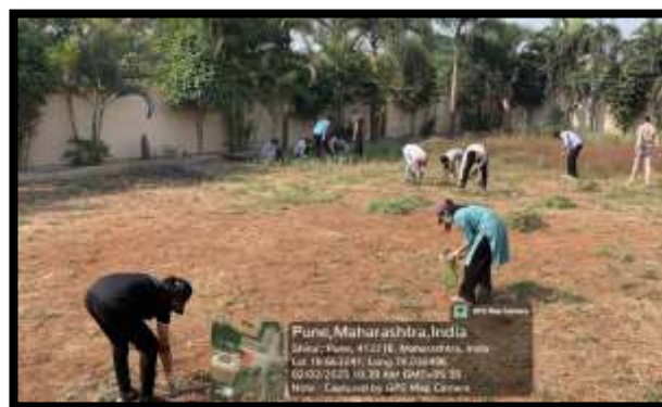
Bhairav Temple after Swachha Bharat Abhiyaan