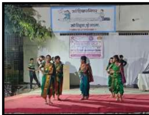
Folk Dance by Participants