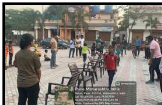
Musical Chair Game organized for small children