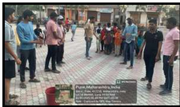
Tap a Ball Game organized for small children