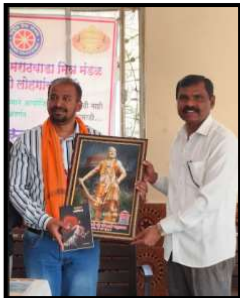
Felicitating of NSS Program Officer