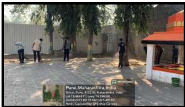
Swachhta at Dharmveer Chatrapati Sambhaji Maharaj Memorial

The day began at 5:30 am with a wake-up call. At 5:45 am, warm-up exercises and stretching were followed by the National Integration Pledge, NSS Anthem, SPPU Anthem, and the National Anthem. The session ended at 8:00 am, and breakfast was served at 8:30 am. From 9:00 am to 12:00 pm, the students cleaned the Dharmveer Chatrapati Sambhaji Maharaj Memorial and the surrounding premises, while also spreading awareness about the importance of Swachh Bharat Abhiyan among the residents. In the afternoon, the students conducted a session for the Z.P. Primary students, from 4th to 7th standard. In the evening, a session was conducted by Mr. Sandesh Sonawane on "Swarajya to Surajya," followed by a Q&A session.