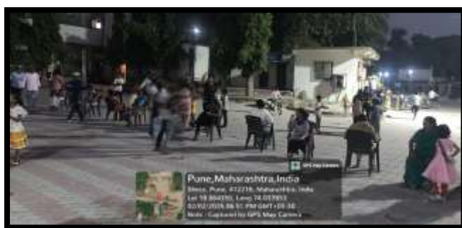
Musical Chair Programme for Ladies of Vadhu Budruk