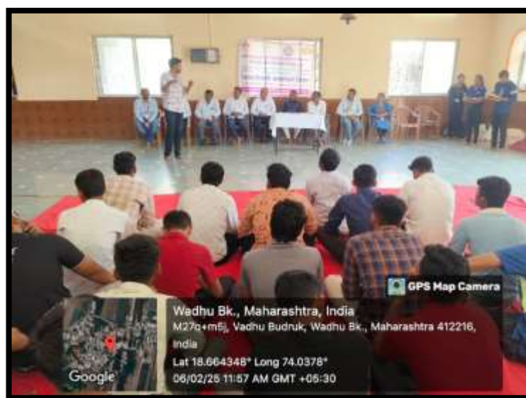
NSS Student Vote of Thanks