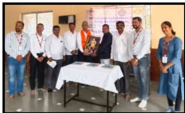
Felicitating of Principal by Sarpanch