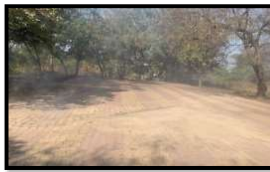
Dashkriya Ghat after Swachh Bharat Abhiyan