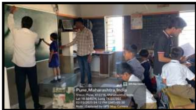
Session at Z. P. Primary School Vadhu Budruk