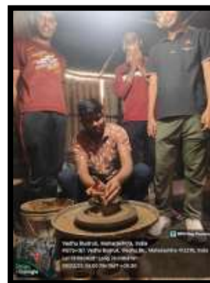
Pot Making by NSS Students