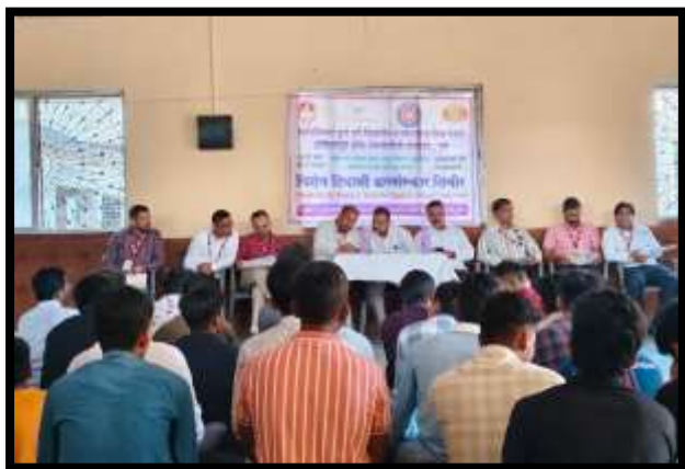
NSS Camp Inaugural Function