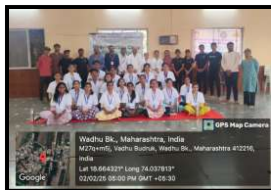
Physiotherapy camp concluded at Vadhu Budruk