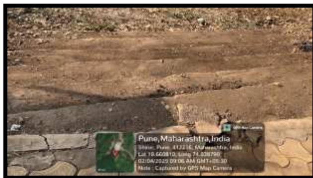
Cremation Ground after Swachhata