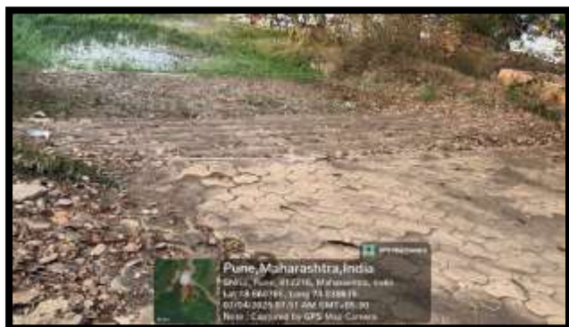
Cremation Ground Before Swachhata

The day started at 5:30 am with a wake-up call. At 5:45 am, warm-up exercises and stretching were followed by the National Integration Pledge, NSS Anthem, SPPU Anthem, and the National Anthem. The session ended at 8:00 am, and breakfast was served at 8:30 am. From 9:00 am to 12:00 pm, the students cleaned the Cremation Ground of Vadhu Budruk and the surrounding premises, while also spreading awareness about the importance of Swachh Bharat Abhiyan among the residents. In the afternoon, NSS students guided the 8th to 10th-grade students of SSM High School, Vadhu Budruk, on Artificial Intelligence and its challenges. In the evening, a mini cultural programme was organized by our students, in which the children of Vadhu Budruk participated with great enthusiasm.