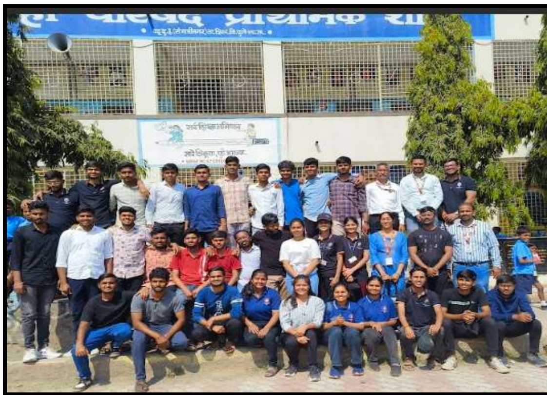
NSS Special Residential Camp Concluded at Vadhu Budruk, Shirur, Pune from 31 st Jan to 6 th Feb 2025