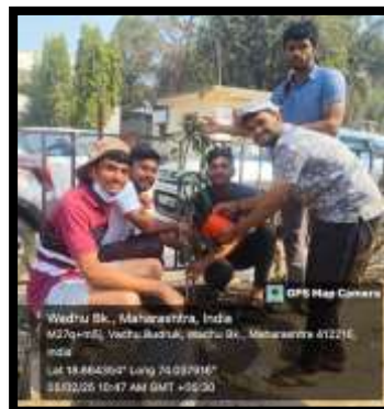
Tree Plantation by NSS Students