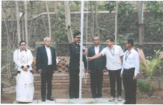
Flag Hoisting by Chief Guest