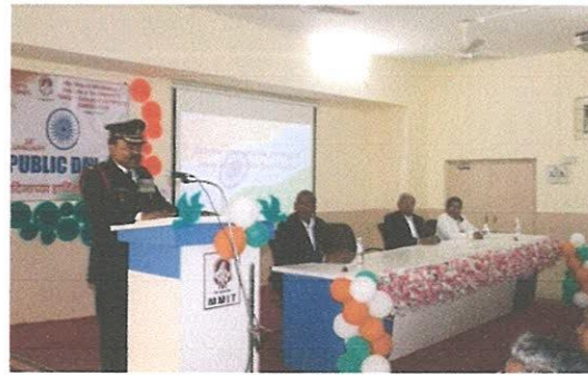
Speech by Chief Guest