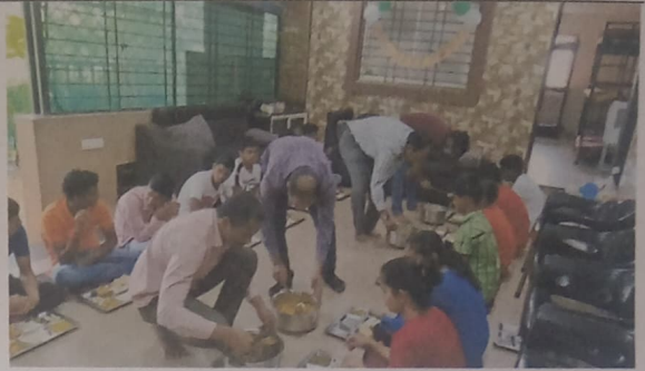
Serving the food to HIV positive children by the faculties