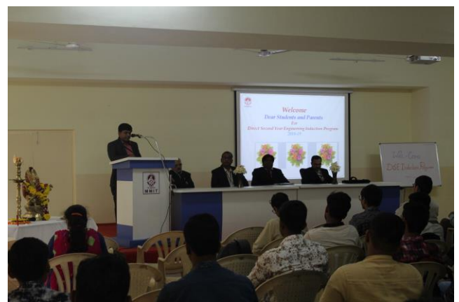
DSE welcome function