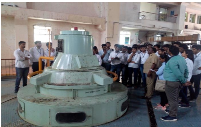
Industrial Visit at Pawana Hydroelectric power plant