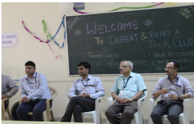
Debate Club Formation