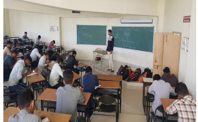
Speech Competition by MESA