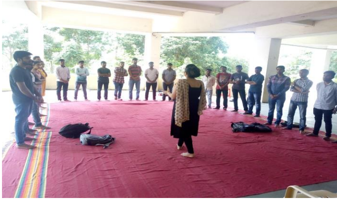
Workshop on Goal Setting and confidence building