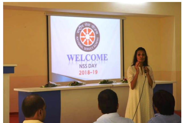
NSS Day Celebration