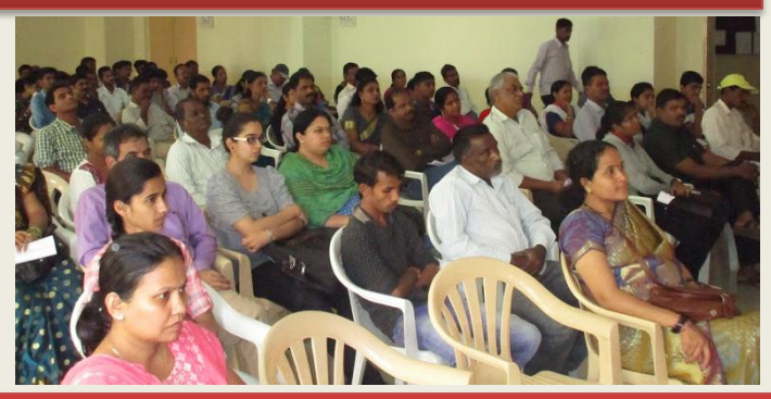
Co-Curricular Activities: Samvitti 2017 (25 March 2017)