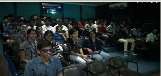
Study Tour – Visit to Pimpari Chinchwad Science Park