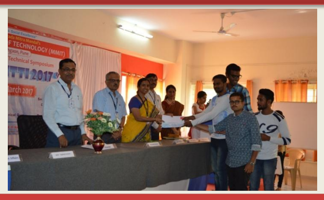
Extension and Social Activities