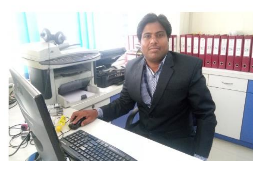
Message From Head of The Department

Welcome and best wishes to all the friends of the Department who receive this Newsletter. It has been an interesting and busy semester for members of the Department.