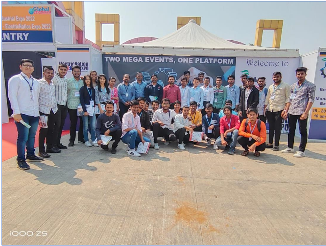
Industrial Visit to Autocluster on 19th November, 2022

Following activities were conducted under M.E.S.A in Sem-I of 2022-23