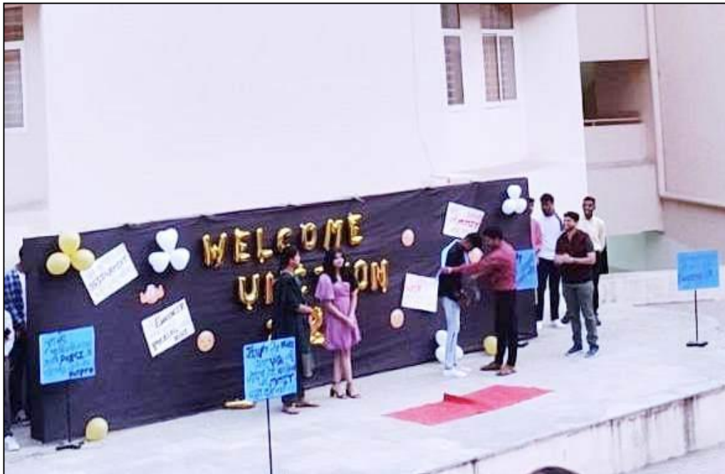
S.E. Welcome Function on 10 th Dec 2022