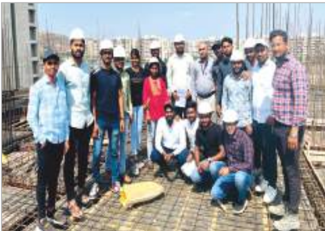
Tencorner, Dhanori, Pune