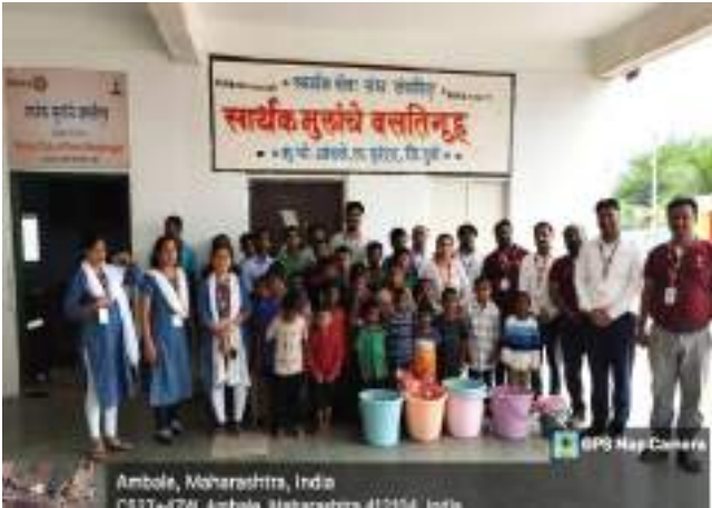
Sarthak Seva sangh Visit