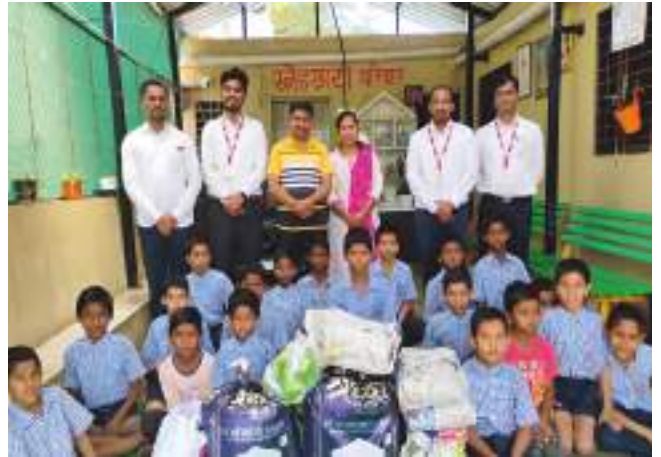
Grocery Donation to Snehcaya Foundation