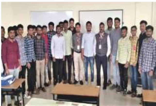
Alumni Interaction for Opportunities In Japan