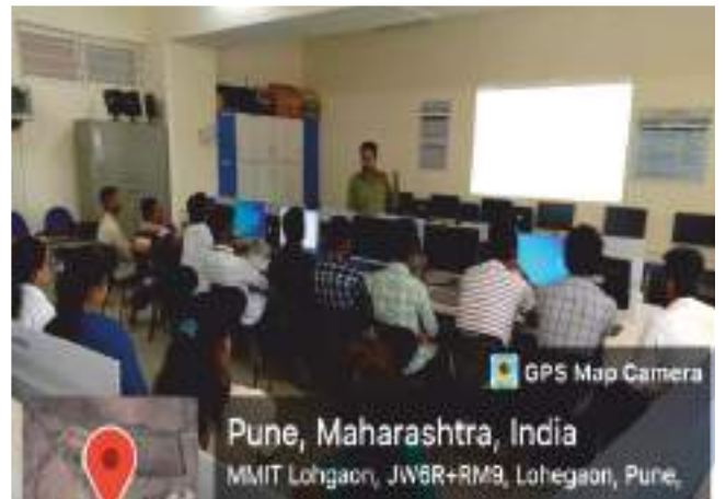
Java Full Stack