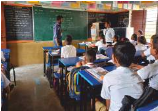
Manthan Scholarship Exam Guidance