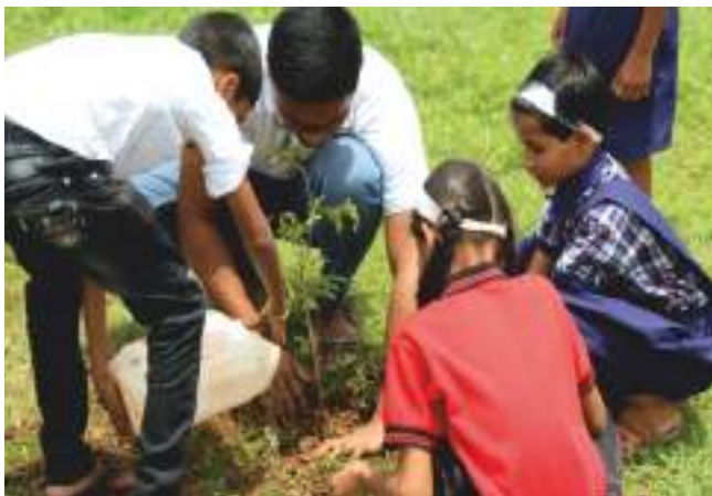
Tree Plantation at S. P. High School Vadhu Budruk