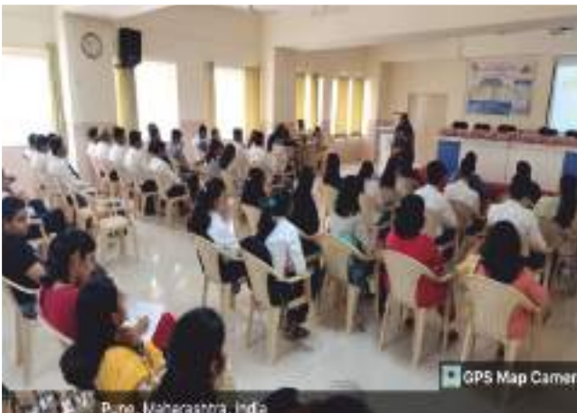
Soft Skill Development Program