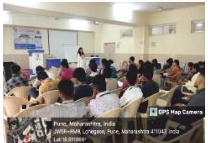
Soft Skill Workshop