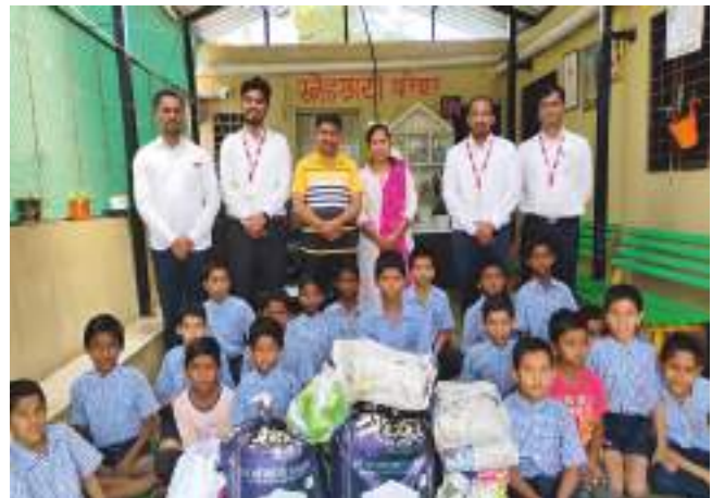
Grocery Donation to Snehchaya Foundation