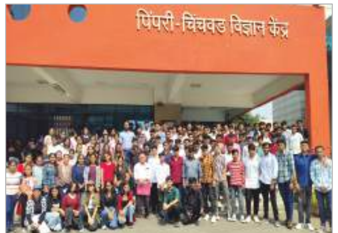
Science Park Pune