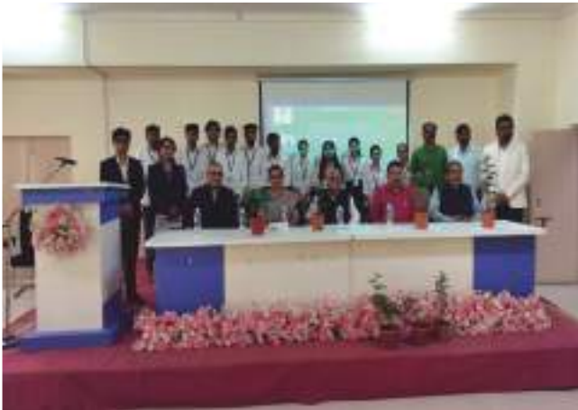
IGS Student Chapter