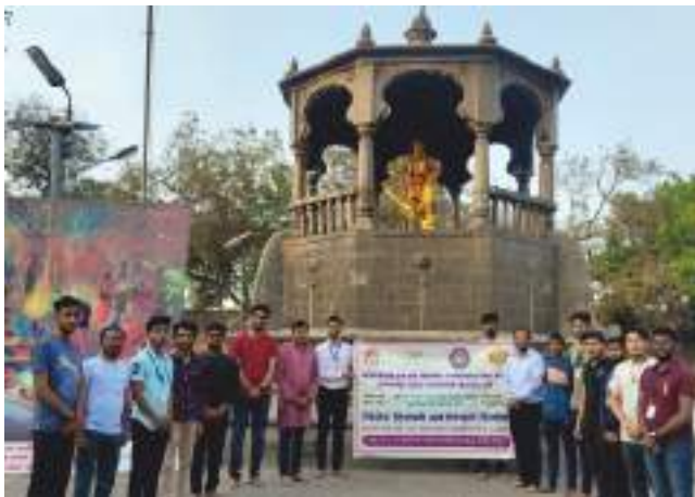
Director , NSS SPPU Visit to MMIT NSS Camp