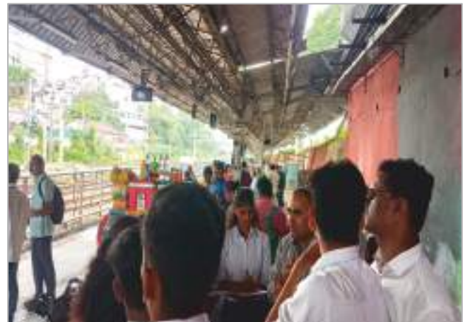
Railway station Pune