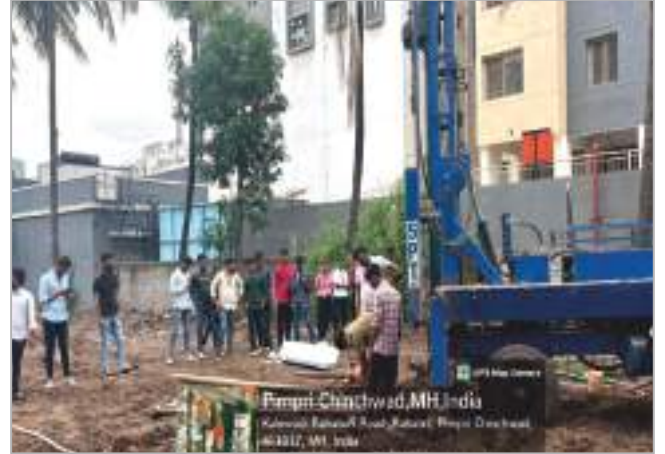
Study of building Foundation