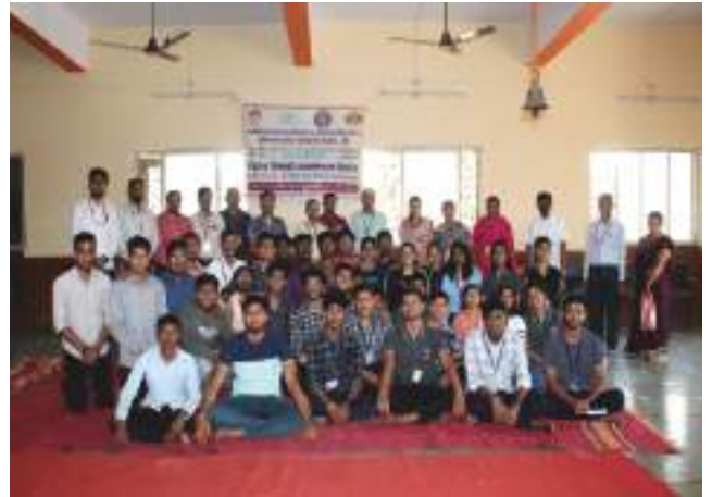
Conculsion of NSS Special Camp Vadhu Budruk