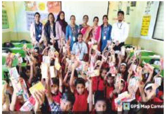
Stationary Donation to Z. P. School