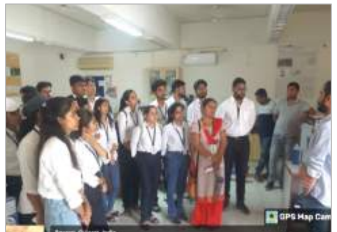
Understanding geology & fundamentals