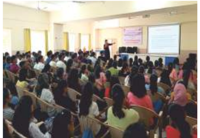
Expert session on Stress management