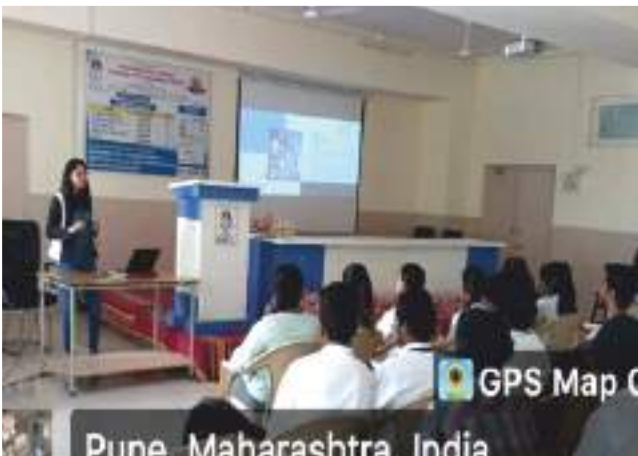
Guest lecture on Entrepreneur