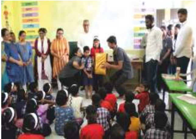
Visit & Donation to Z. P. School