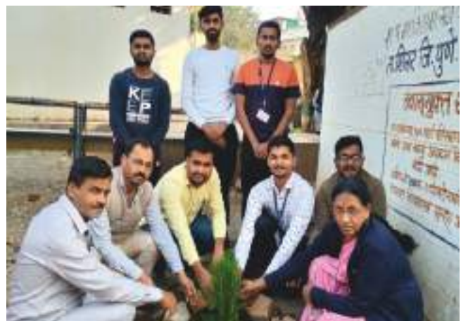
Tree Plantation Programme