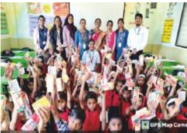
Stationary Donation to Z. P. School