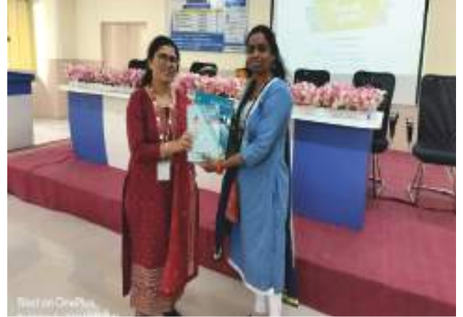
Employability Skill Development Workshop