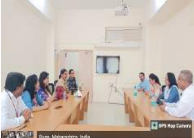
Academic Audit Meeting