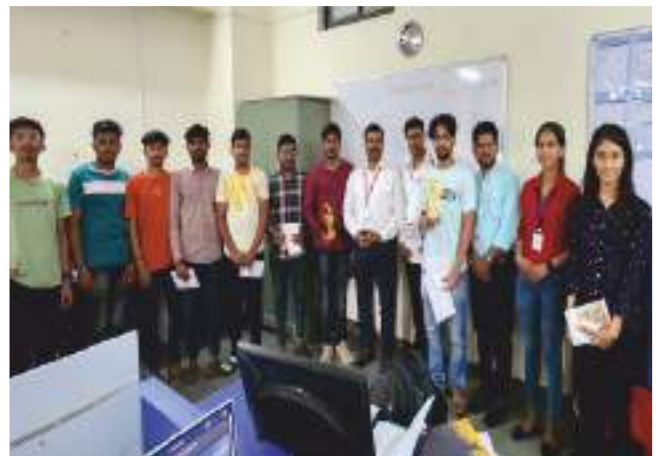
CAD War Event