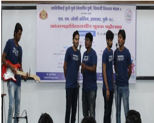
Group Song (Western)