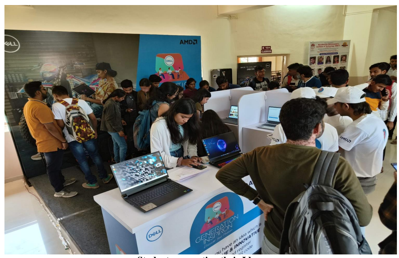
Students presenting their Ideas