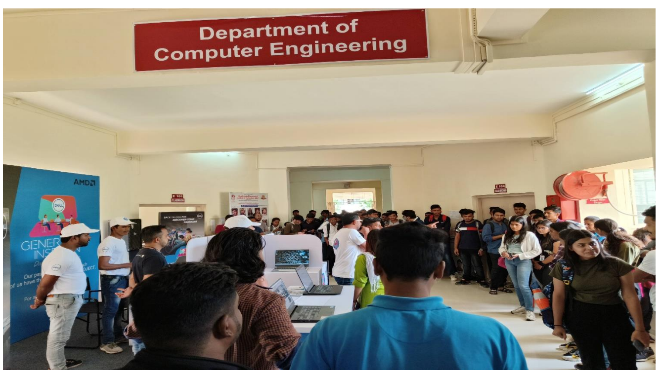
DELL representee addressing to the students