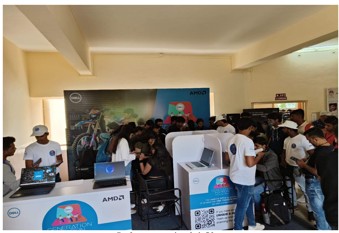
Students presenting their Ideas