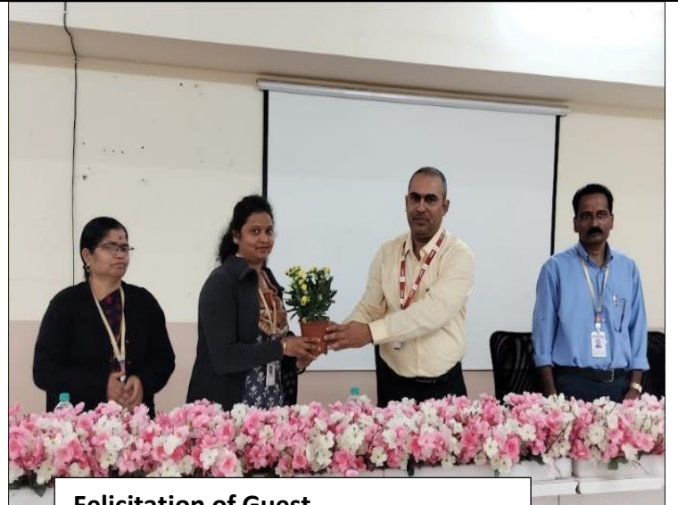
Felicitation of Guest